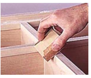
11--Put a small, crisp bevel on the facing and edge strips with a sanding block that you move perpendicular to the strip's edge.

Use a small-diameter, smooth-surface paintroller to apply a coat of latex primer to all cabinet surfaces (Photo 12) . Note that the long-handled roller used here has one end that is somewhat shaggy. This allows you to apply paint right to the corner. When the primer is dry, sand it lightly with 220-grit sandpaper. Finish the project by applying two coats of latex semigloss paint for an attractive finish.