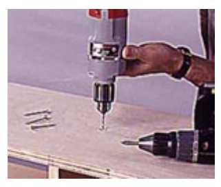
6--Bore and countersink pilot holes into the top of the short partitions. Then drive screws to fasten the partitions and panel.