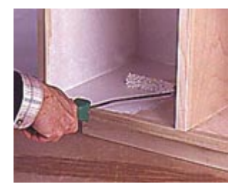
12--A small-diameter roller is used to apply the primer and top coat. The square end of the roller allows it to paint into corners.