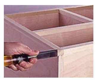
8--Use a chisel to cut a small clearance notch in the top corner of each vertical facing strip. Cut in toward the case.

7--Drive finish nails at an angle through the tall partitions and the middle shelf, and into the short partitions.