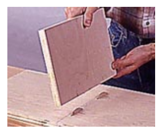
5--The short partitions are attached to the panel above with screws, so there is no need to use glue with the joining plates.