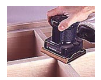
10--Sand the surfaces carefully using a randomorbit block sander. This tool is small enough to fit into the compartments.