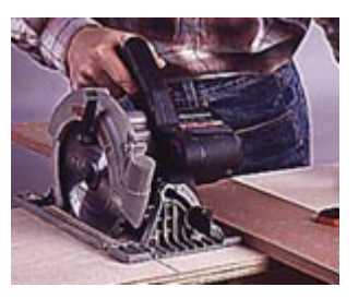
1--Clamp a straightedge across the workpiece and crosscut it with a circular saw. Support the piece that will be cut off.

Mark the locations of plate joint slots in the cabinet sides, shelves and partitions. Note that the middle shelf has staggered slots on the top and bottom surfaces. It's important to stagger the slots to prevent too much wood from being removed in one location.