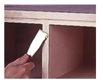
9--Use a putty knife to press drying filler into the nail holes. Slightly mound the filler, and let it harden before sanding.