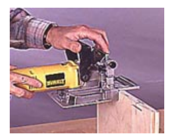
4--Clamp the case sides upright in a vise and cut the slots along their upper edge using the plate joiner's fence for alignment.

cutting the plate slots for the shelves.