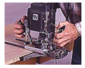
2--Use a straight bit in the router and the edge guide attachment to cut a rabbet along the back edge of the side panels.