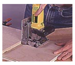
3--Clamp a fence across a case side, and use it to guide the plate joiner when